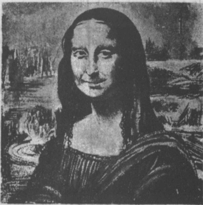
You'd smile too if you had a savings account at

NOTICE—Any erroneous reflection upon the character, standing or reputation of any person, firm or corporation which may appear in the columns of The Informer will gladly be corrected upon its being brought to the attention of the publisher.