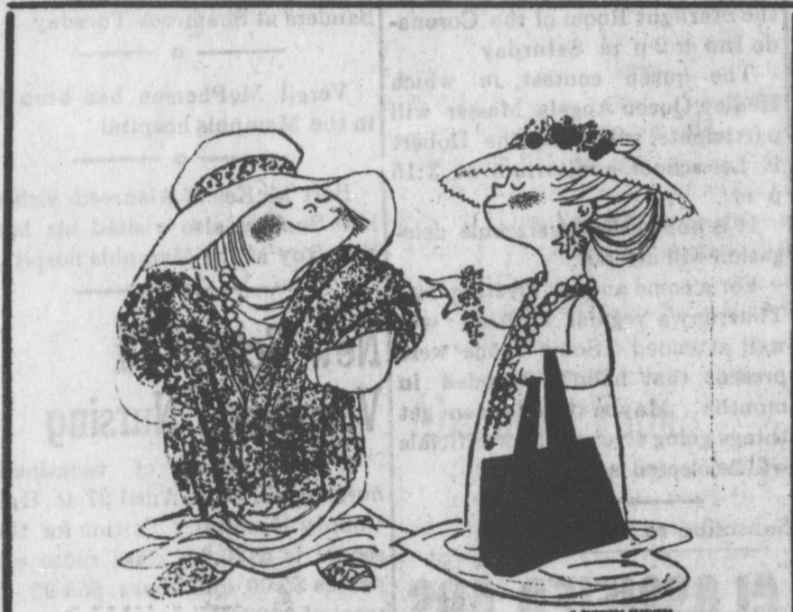
Smart ladies save at

NOTICE—Any erroneous reflection upon the character, standing or reputation of any person, firm or corporation which may appear in the columns of The Informer will gladly be corrected upon its being brought to the attention of the publisher.