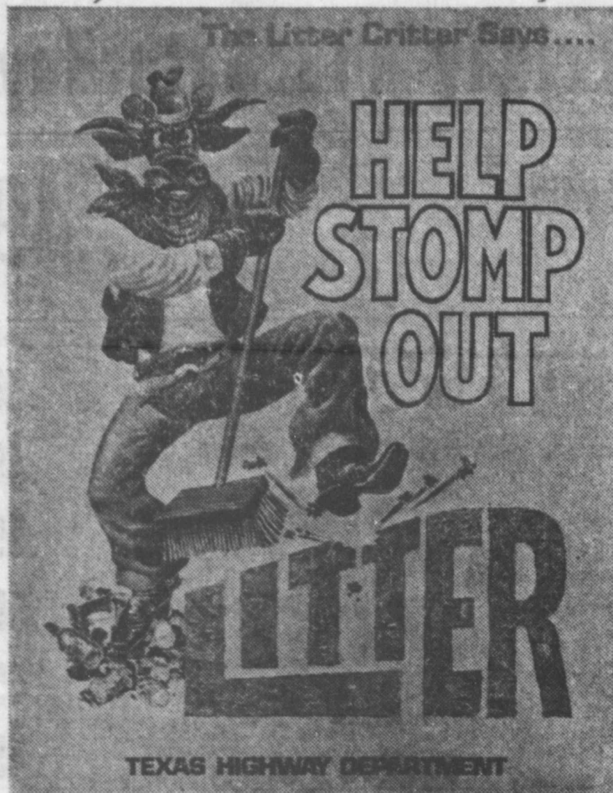
BITTER CRITTER — The Litter Critter, the Texas Highway Department's faithful sidekick in the battle against highway litter, now is making his appearance on colorful 17x22-inch posters. Litter pickup costs the Department $2 million a year. Schools, garden clubs and other organizations concerned about litter may obtain the posters from Highway Department District Offices, Tourist Information Bureaus or the Travel and Information Division, Texas Highway Department, Austin (78703).