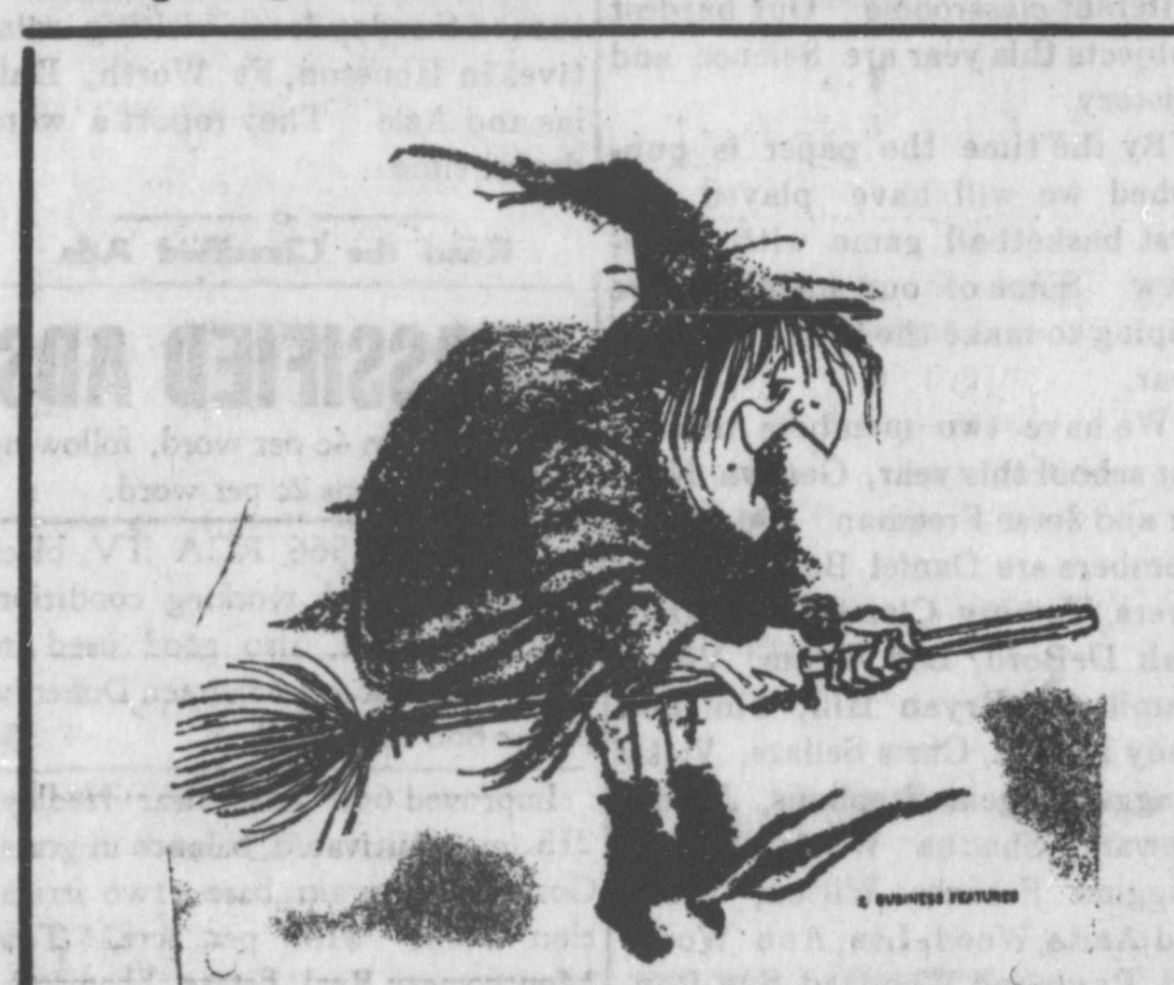
You'll find it bewitching to bank at

NOTICE—Any erroneous reflection upon the character, standing or reputation of any person, firm or corporation which may appear in the columns of The Informer will gladly be corrected upon its being brought to the attention of the publisher.