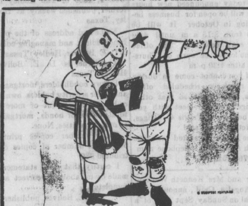
No argument about it ... the best place to get a loan is at

NOTICE—Any erroneous reflection upon the character, standing or reputation of any person, firm or corporation which may appear in the columns of The Informer will gladly be corrected upon its being brought to the attention of the publisher.