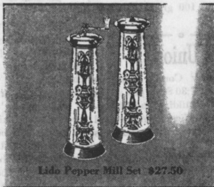
Lido Pepper Mill Set $27.50