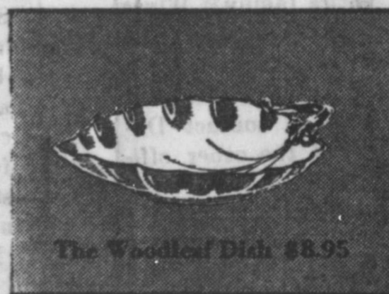
The Woodcock Dish $8.95