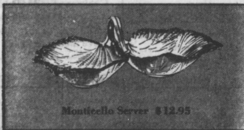
Monticello Server $12.95

Our courteous staff will be happy to help you.