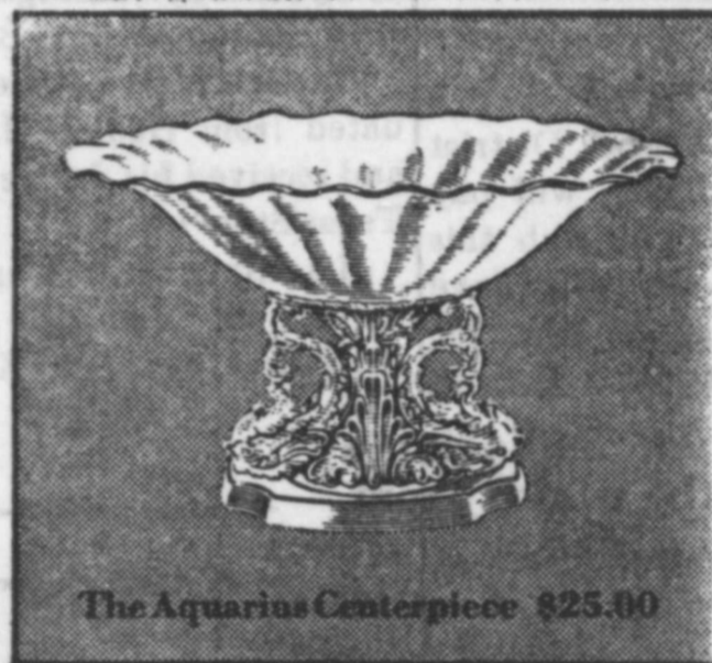
The Aquarius Centerpiece $25.00

Ken Taylor Garage is the local inspection station.