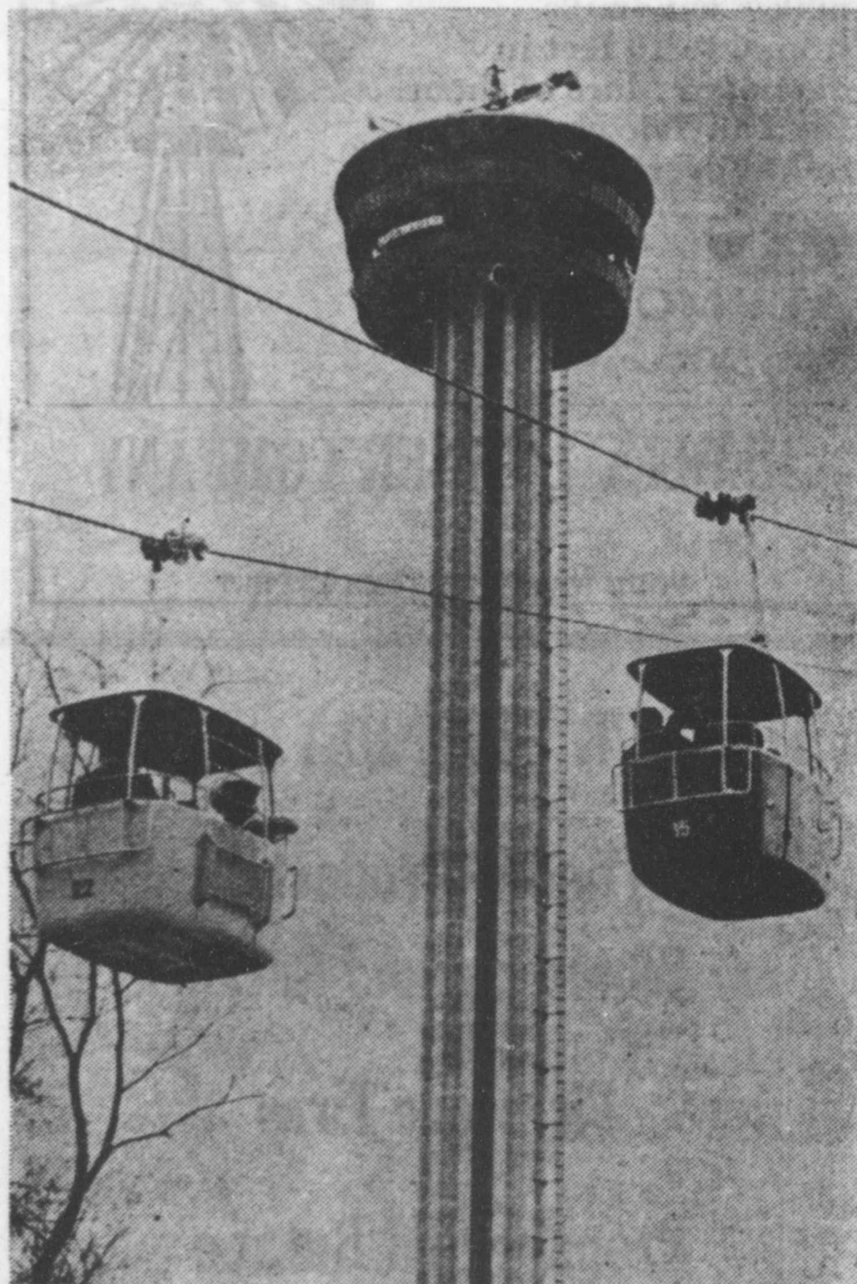
SWISS SKYRIDE—Sidewalk superintendents are viewing progress on HemisFair '68 from the air with the help of the Swiss Skyride over the World's Fair grounds. These early bird visitors are part of more than 20,000 persons who have taken the skyride since it was opened to the public on Christmas weekend. The 622-foot Tower of the Americas with its six-story tophouse in place draws the attention of many sightseers.