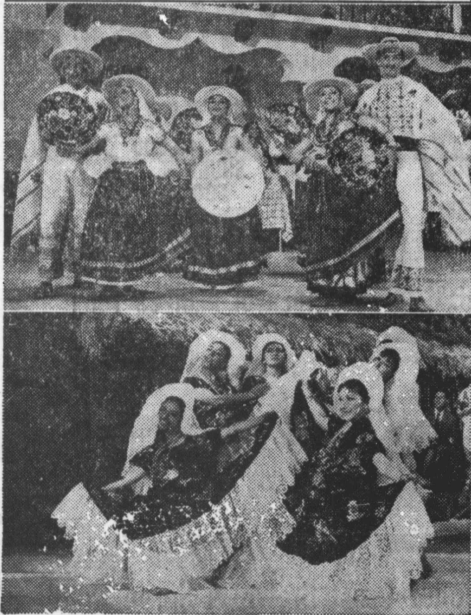
"OLF!" "Danzas y Cantos de Mexico," internationally known folkloric troupe of colorfully costumed musicians, singers and dancers, will be presented in an eight-day engagement at the 1965 State Fair of Texas, October 9 through 24 in Dallas. First appearance will be in the Mexico Day Cotton Bowl Spectacular at 8 p.m. Thursday, October 14, followed by two daily free performances October 15 through 21 on the Esplanade Stage. The group is being brought to the State Fair through cooperation of the Mexican government.