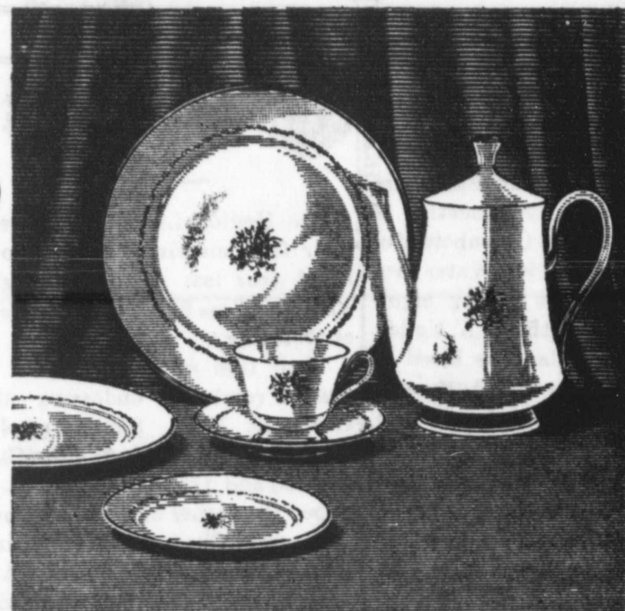
CARLYLE Place setting: dinner, salad, butter plates, teacup

Truly the ultimate in fine bone china. Pure white, delicately translucent, yet miraculously strong. An enchanting basketful of colorful fruit and greenery hand-applied in raised enamel, is encircled by a dainty garland of colorful berries echoing the enchanting motif. Gleaming platinum rim. 5-piece place setting, $37.95