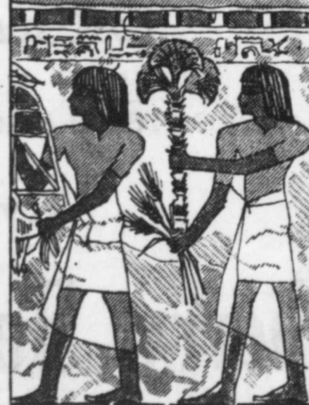
Barley is one of the oldest known grains.

barley production, followed by France, Canada, the United Kingdom, West Germany, and Turkey. North Dakota, California, Montana, Minnesota, and Washington are our top barley producing states.