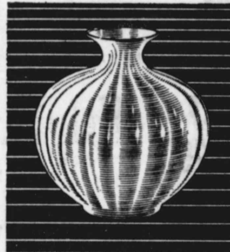
SWEETBRIAR BUD VASE. Gracefully fluted, charmingly versatile. Handcrafted. Height: 4 1/2". 24-k. gold trim...$5.95