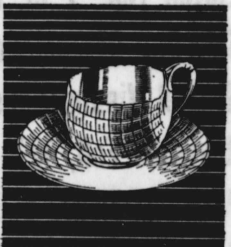
COLLECTOR'S CUP #8. Dainty demitasse. Reproduction of Lenox piece #8. Designed 1889. Limited edition...$7.95