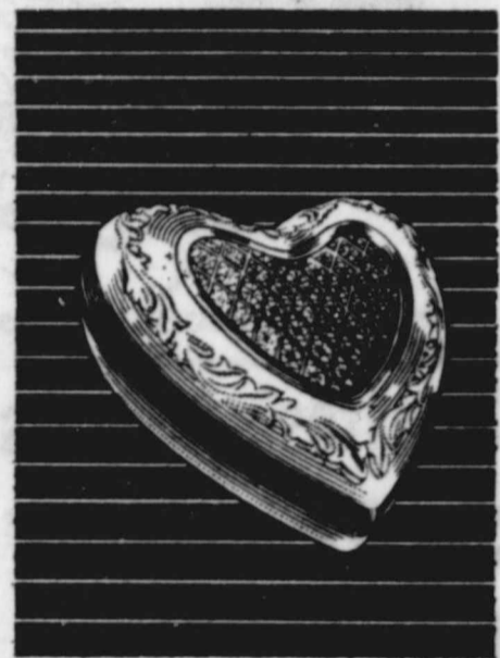
THE HEART BOX. Delightful little box with nostalgic charm. 4" long. 24-k. gold trim...$7.95