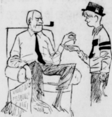
Need an auto loan?

Sunday: Sunday School ..... 10:00 a.m. Morning Worship .. 11:00 a.m. Training Union ... 7:00 p.m. Evening Worship ... 8:00 p.m. Wednesday: Prayer Meeting ..... 7:00 p.m.