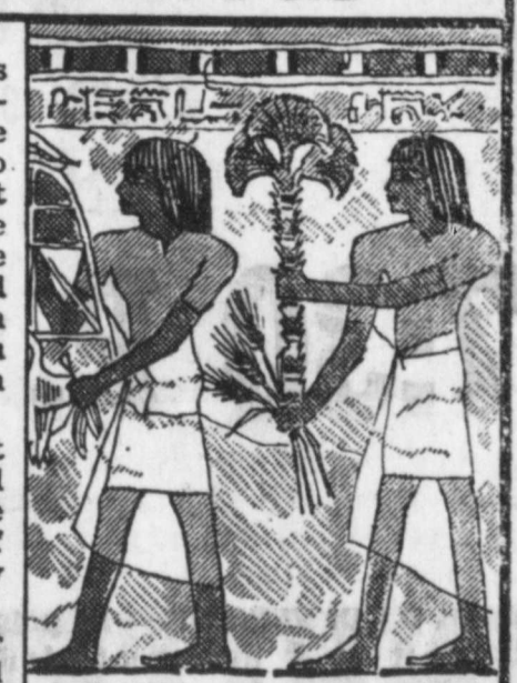
Barley is one of the oldest known grains.

than 85 million bushels are by France, Canada, the consumed in the U.S. annual- United Kingdom, West Gerly for alcohol and alcoholic many, and Turkey. North beverages as compared with Dakota, California, Montana, about 230 million bushels for Minnesota, and Washington are our top barley producing