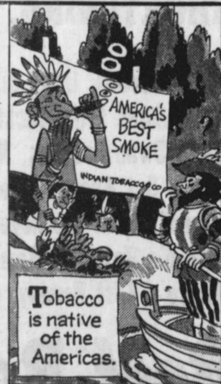
Tobacco is native of the Americas.

North Carolina is by far the largest tobacco producing state. The 1961 crop in the Tarheel State totaled almost 844 million pounds, compared with 391.3 million for Kentucky, 153.4 million for Virginia, 151.8 million for South Carolina, and 137.6 million for Georgia.