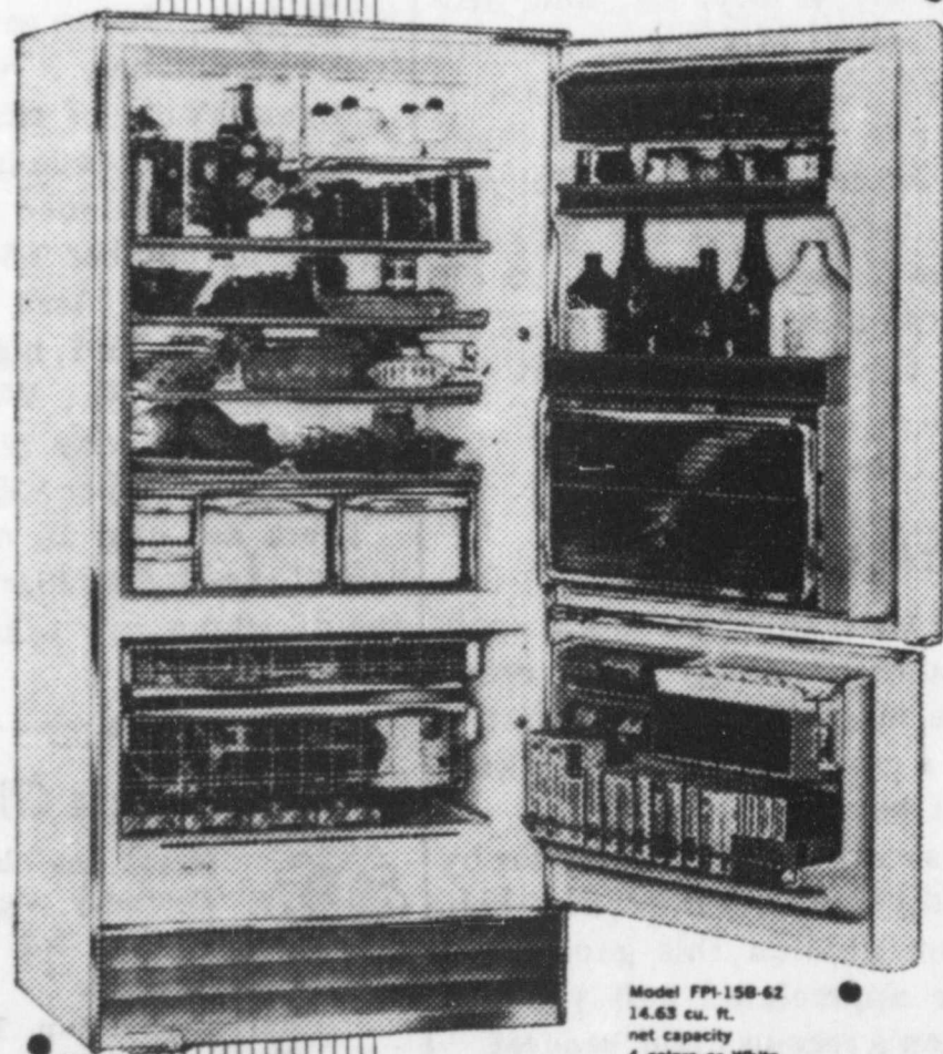
Model FPI-15B-62 14.63 cu. ft. net capacity 4 colors or White