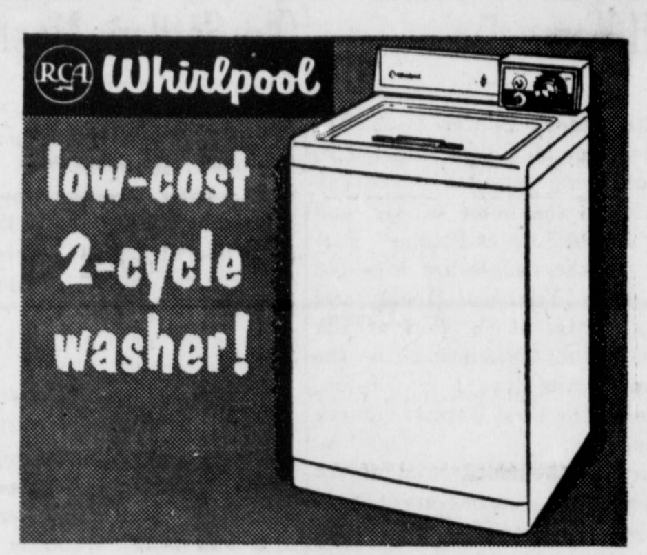
Washes 9 pounds at once, yet it's only 24" wide!