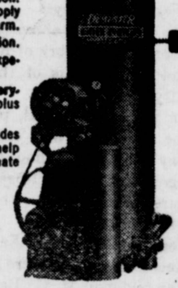
Deep Well Reciprocating Pump