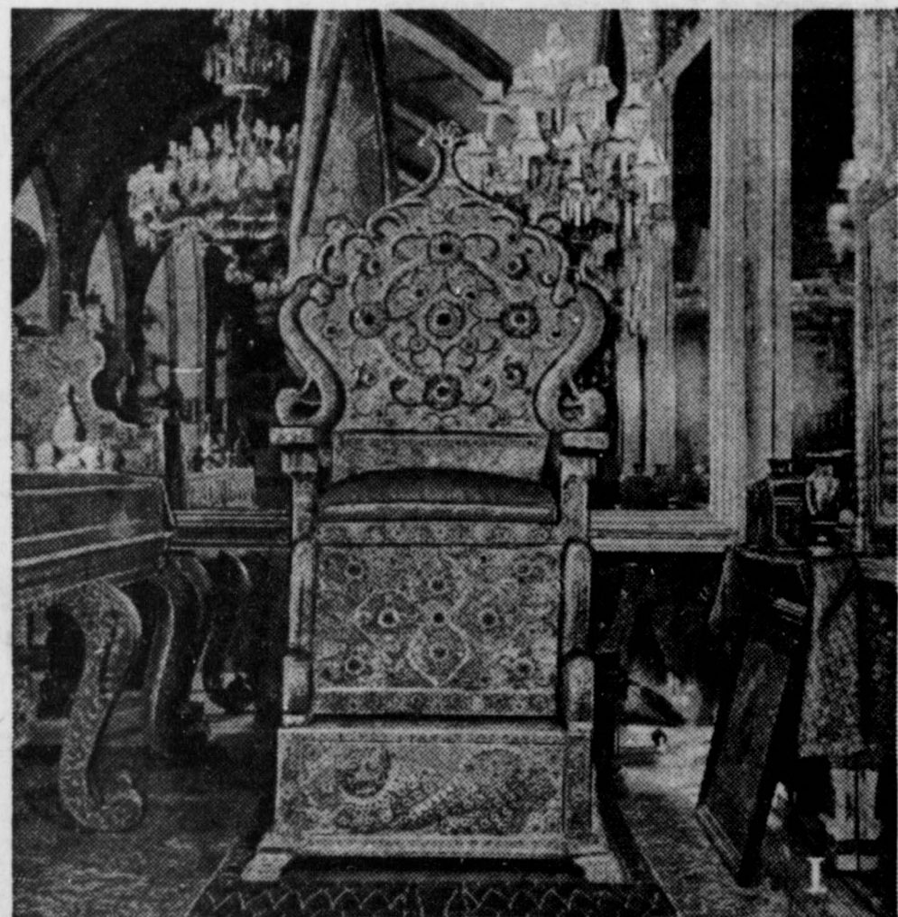
PERSIA'S ROYAL CHAIR: The ultra-modern city of Teheran, capital of the Kingdom of Iran (ancient Persia), is one of the most stimulating sights on a trip to the Middle East or a round-the-world flight. The capital is located in the northern part of the country near the Caspian Sea and is dominated by the rugged Alburz Mountain range, notably by 18,600 foot, snow-capped Mt. Damavand. Its broad boulevards, stately palaces, fragrant gardens and picturesque bazaars never fail to delight the visitor from the West. The city boasts four museums crammed with contemporary art as well as the treasures of the past and the most famous is the Gulistan (rose garden) Palace, serving both as a site for royal functions and the Royal Museum. The Palace's most fabulous attraction is the century-old Peacock Throne, brought from India in the early part of the last century. As the above photograph shows, it is covered with gold and incrustated with rubies, emeralds and diamonds, set in an exquisite enamel pattern. Surrounding it are glittering mirrors and hanging above it are shimmering chandeliers.