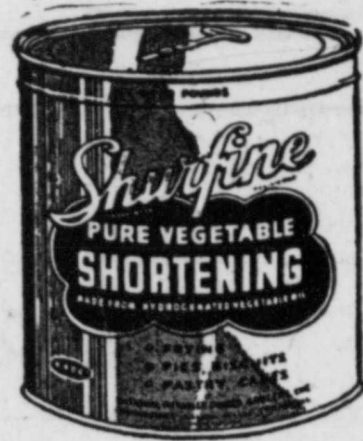
3 lb. can