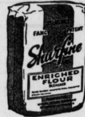
10 lb. bag .75 25 lb. Cotton bag $1.69