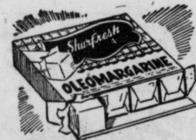
5 lbs. $1