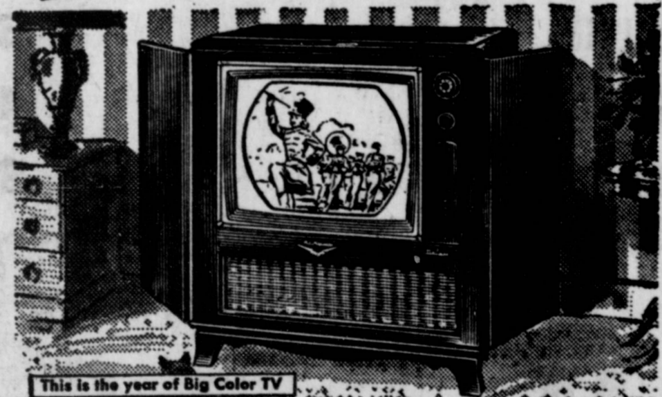
Cheltenham 21. UHF-VHF tuner. Three-speaker Panoramic Sound System. Mahogany with special figured doors or birch (Modern styling). Deluxe model 21CT663.

Now! See more colorcasts than ever before!