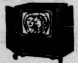
Gainsborough 21. Same features as Cheltenham 21, but in Provincial style. Natural walnut or maple. Deluxe model 21CT664.

The Cheltenham 21 brings you color shows on a huge 250 square inches of viewable picture area. It's Compatible too, so you also enjoy black-and-white programs in black-and-white. And the magnificent cabinetry adds new beauty to your home. Come in—see—buy RCA Victor Big Color TV today!