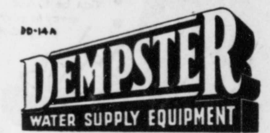
Deep Well Reciprocating Pump