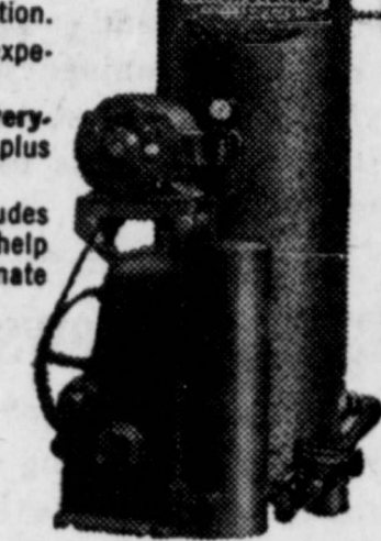
Deep Well Reciprocating Pump

FREE Water Survey...Your DEMPSTER service includes a complete water survey of your farm. It will help you select the right water system, and estimate installation and operating costs. Ask us for your FREE Water Survey forms today.