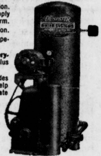
Deep Well Reciprocating Pump

Running water is the first step in farm modernization. Remember these advantages of DEMPSTER Water Supply Equipment when you consider running water for your farm. Economical ... Low in initial price and cost of operation. Dependable ... Backed by more than 70 years of experience in the water supply industry. Complete Line ... Pumps, pipe, fittings, tanks—everything you need for the entire installation, plus the complete service that goes with it. FREE Water Survey ... Your DEMPSTER service includes a complete water survey of your farm. It will help you select the right water system, and estimate installation and operating costs. Ask us for your FREE Water Survey forms today.