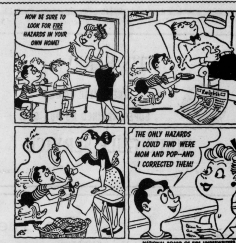
CHECK YOUR HOME FOR FIRE HAZARDS TO-DAY Sponsored by Hedley Volunteer Fire Dept.

No Parking 7 AM to 10 AM Tuesday morning on Main Street,