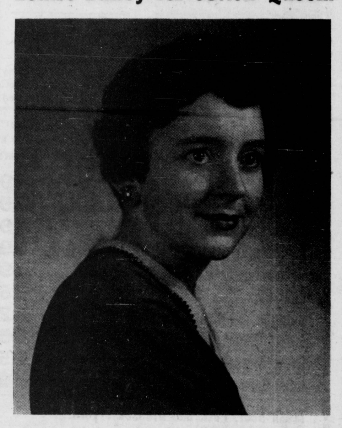
Sponsored by City Drug Store