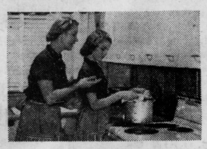
The deep-well cooker has many uses, not only for meals — but many other things — to make large quantities of coffee or cocoa at party time, to sterilize baby's bottles — and even to pop corn!