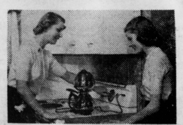
You can plug in the coffee-maker the night before, set the automatic clock timer, and coffee's ready when you get up in the morning — you can plug in the toaster or other appliances, too.