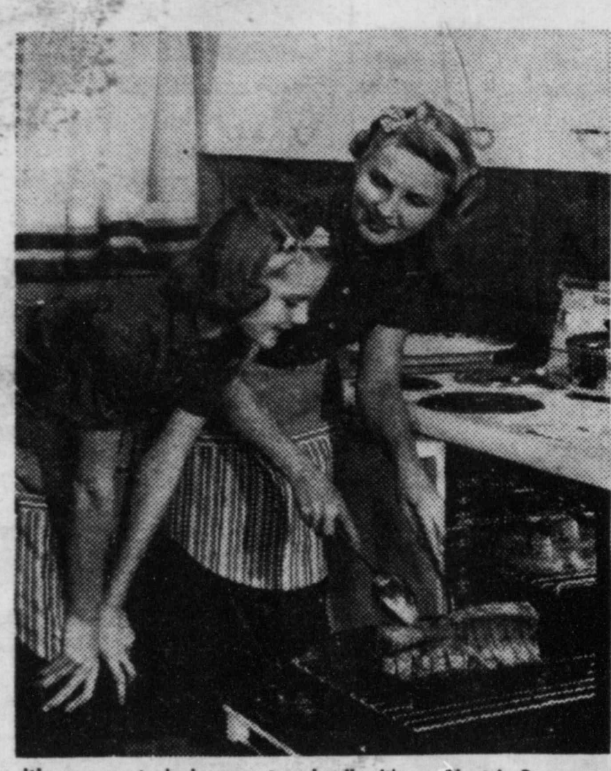
It's so easy to bake, roast or broil with an Electric Range... no flame, less shrinkage of roasts, cleaner cooking, and a cleaner kitchen.