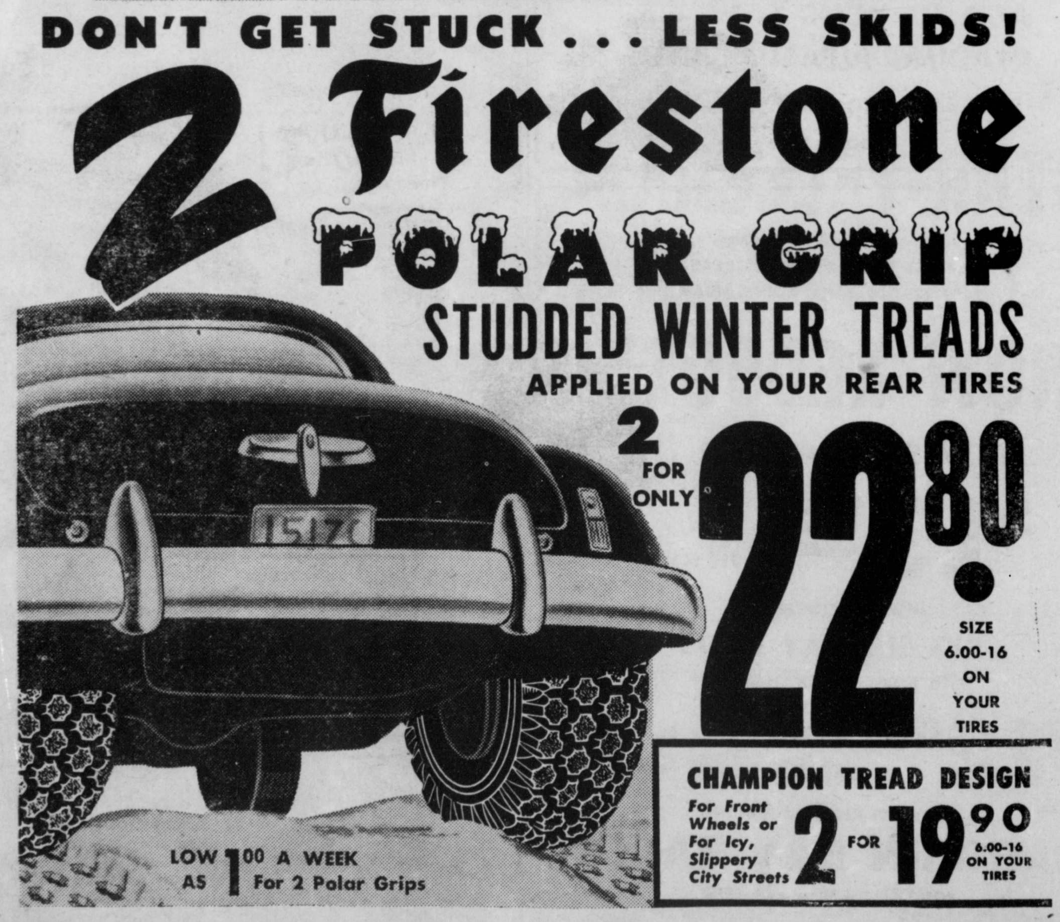
Harrison Hall Service Station--Phone 34