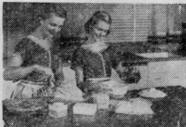
A complete Sunday dinner, prepared weeks in advance and stored in the freezer, is ready to heat and serve when needed. Hamburgers, wieners, and lunches for picnics can be frozen in advance.