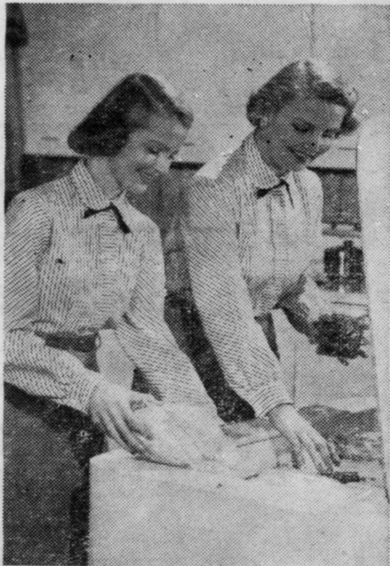
An Electric Freezer saves time and trouble in many different ways, and provides better meals. For the holidays, mince pies, puddings and the like can be baked in advance and frozen. Chili con carne, spaghetti and chop suey can be packed in meal-size containers, and frozen for future use.