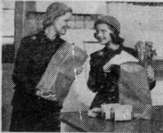
With an Electric Home Freezer you can shop every couple of weeks instead of every day or so. Buy meats, fruits and vegetables when they're on sale; save money that way. You simply freeze and store until needed.

"And we're never 'out of things'. When they have bargains at the stores — in frozen foods or in meats — I can stock up on them. I never have to throw leftovers away — just freeze them to use weeks later. So you see, this freezer saves me time and saves your Dad money, too!"