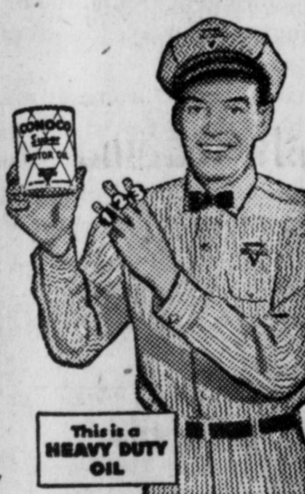
This is a HEAVY DUTY OIL

3 He'll refill with great Conoco Super Motor Oil! Conoco Super is fortified with additives that curb dangerous accumulation of dirt and contamination—protect metal surfaces from corrosive combustion acids—fight rust—OIL-PLATE against wear.