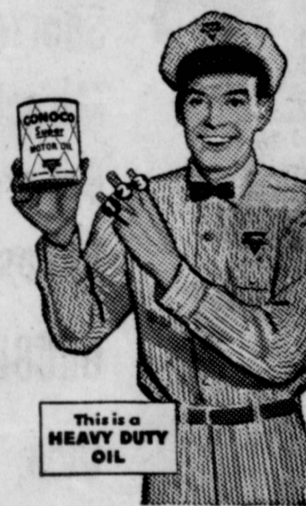
This is a HEAVY DUTY OIL

3 He'll refill with great Conoco Super Motor Oil! Conoco Super is fortified with additives that curb dangerous accumulation of dirt and contamination—protect metal surfaces from corrosive combustion acids—fight rust—OIL-PLATE against wear.