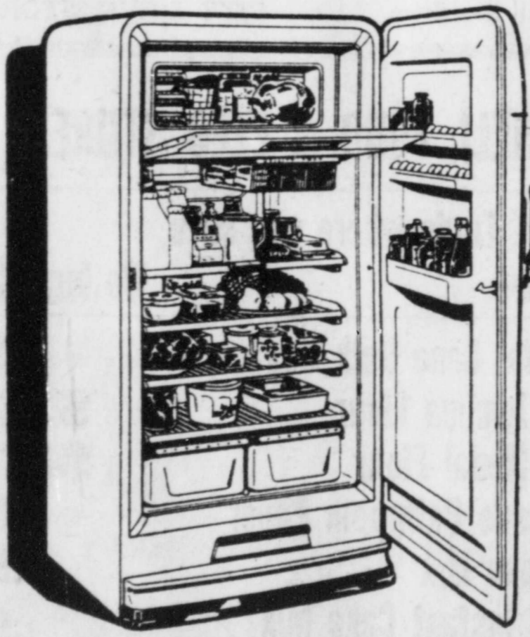
New, Exclusive Levelcold

A Food Freezer and refrigerator combined—each with exclusive new LEVELCOLD!