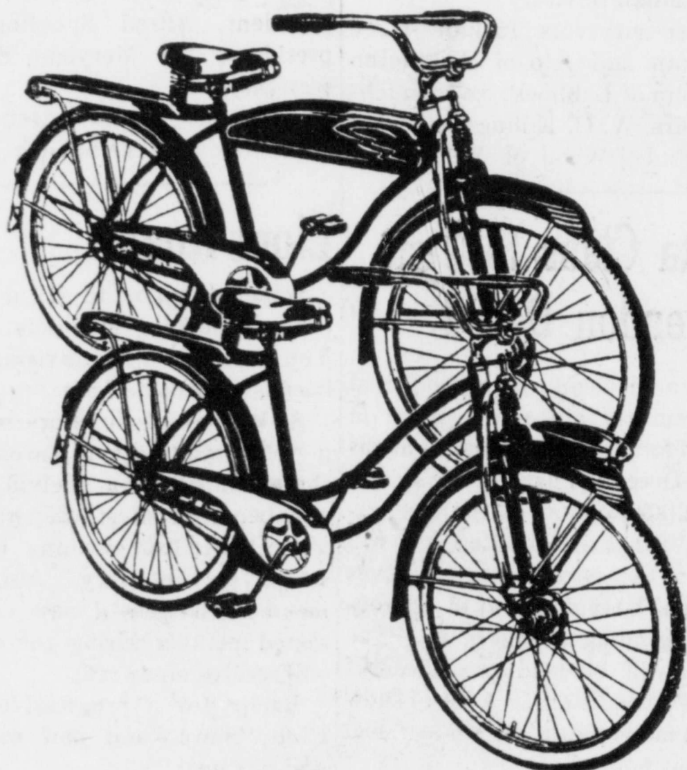
Choice of a Boy's or Girl's BICYCLE

To Two of Our Customers on Monday, December 24th