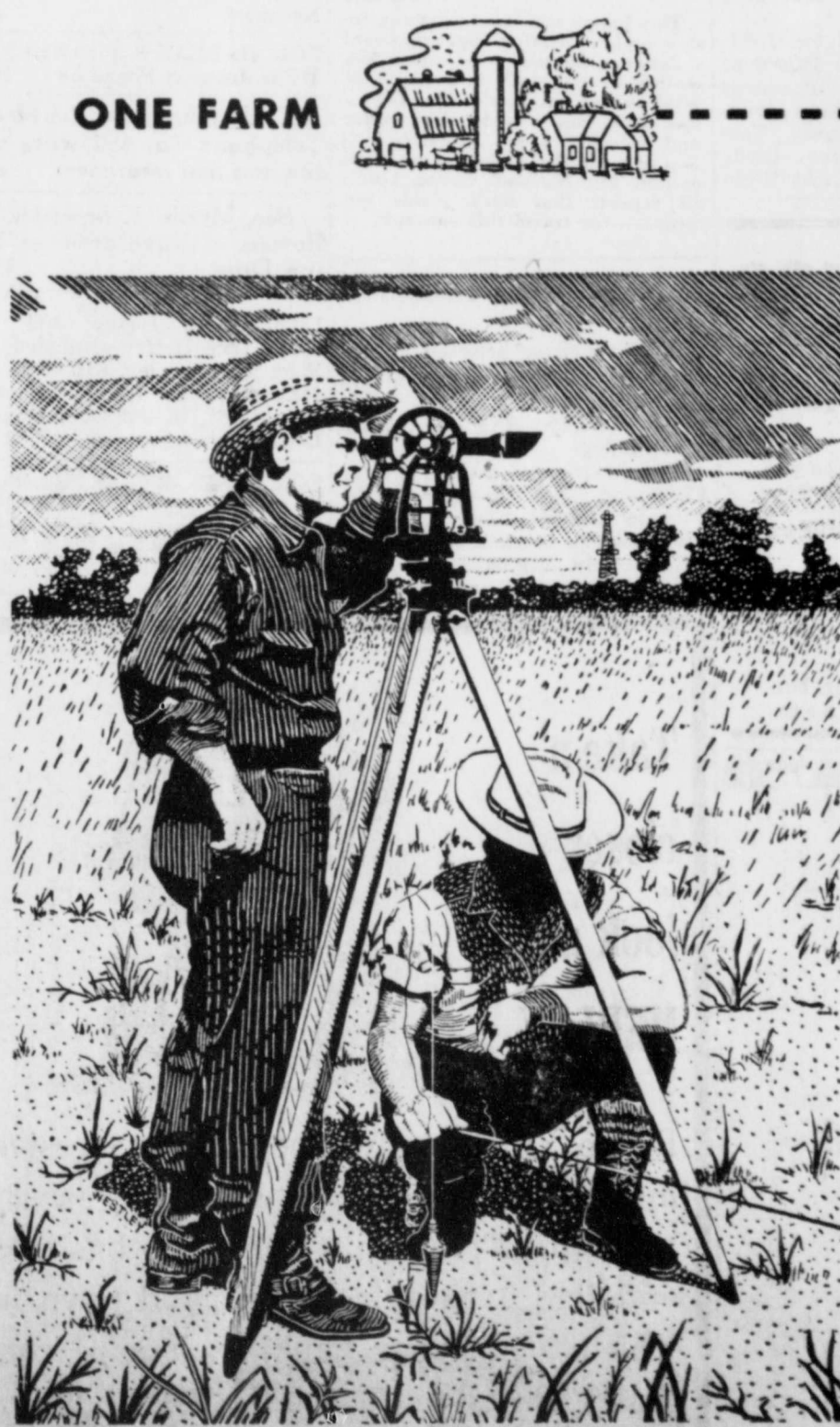
United Gas survey crew lays out a right-of-way for a new United Gas pipe line.