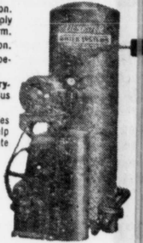
Deep Well Reciprocating Pump

Running water is the first step in farm modernization. Remember these advantages of DEMPSTER Water Supply Equipment when you consider running water for your farm. Economical ... Low in initial price and cost of operation. Dependable ... Backed by more than 70 years of experience in the water supply industry. Complete Line ... Pumps, pipe, fittings, tanks—everything you need for the entire installation, plus the complete service that goes with it. FREE Water Survey ... Your DEMPSTER service includes a complete water survey of your farm. It will help you select the right water system, and estimate installation and operating costs. Ask us for your FREE Water Survey forms today.