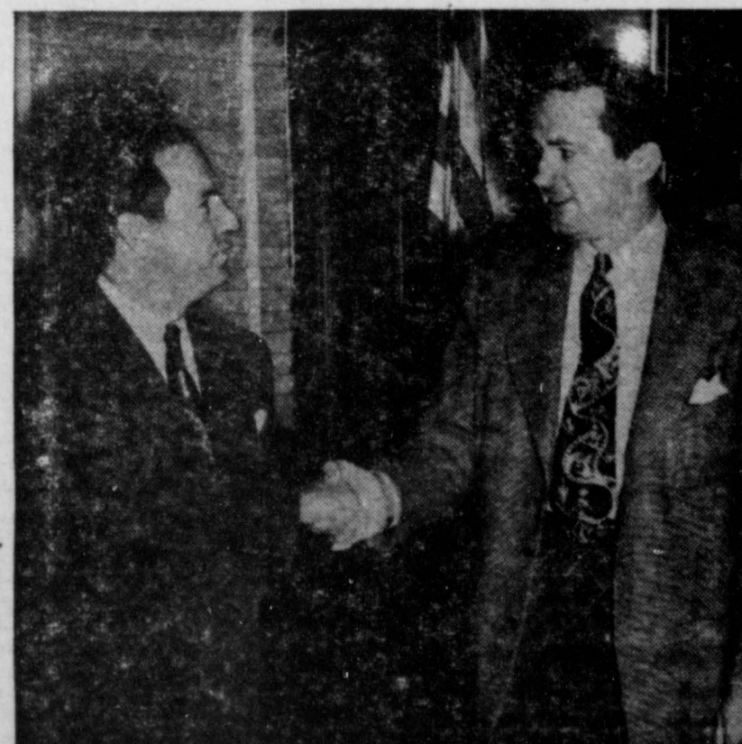
SHIVERS GREET'S ECONOMY COMMISSION DIRECTOR