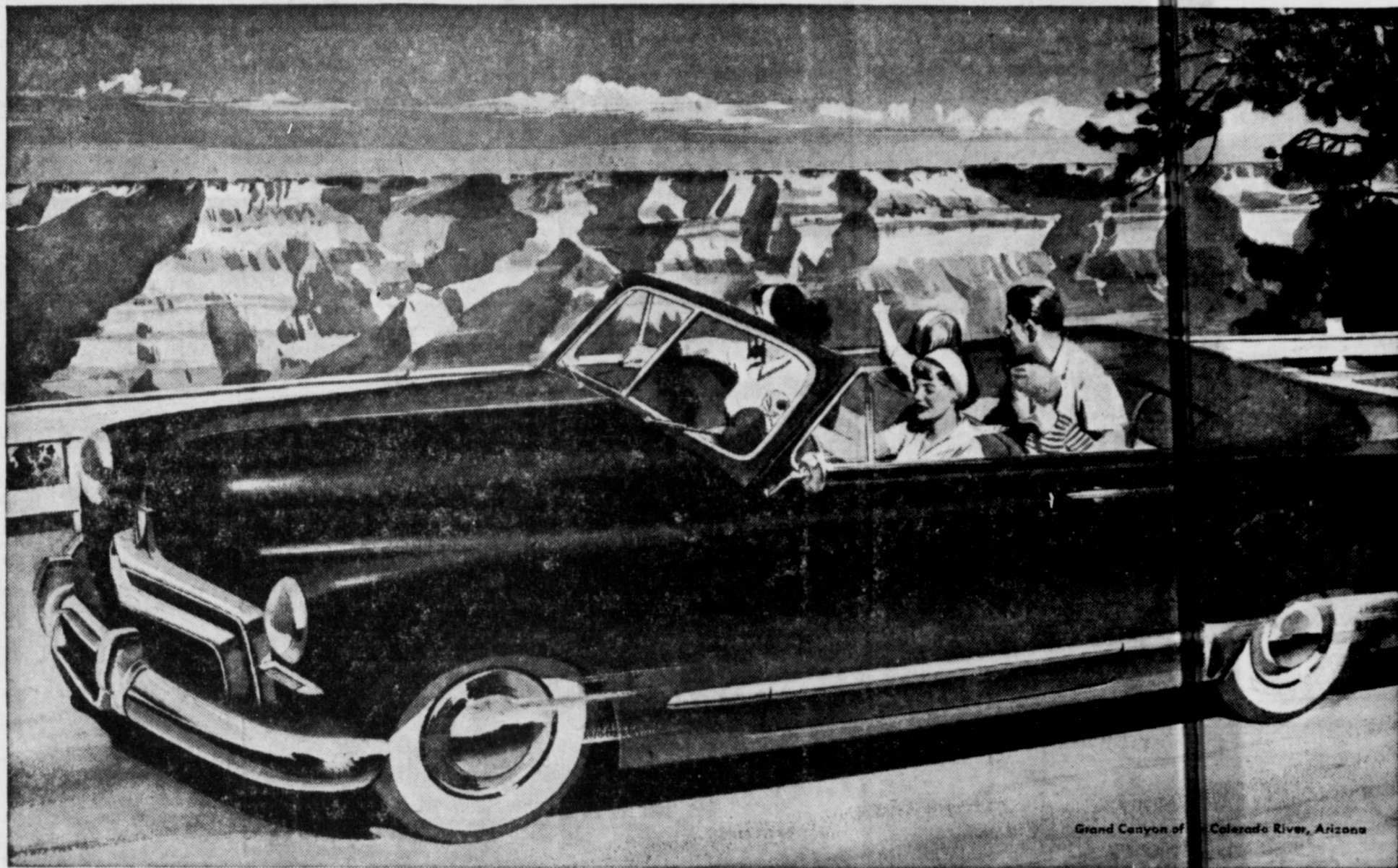
Grand Canyon of Colorado River, Arizona