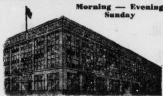
NEW MODERN STAR-TELEGRAM PLANT

Morning — Evening Sunday The Reader Saves $4.05