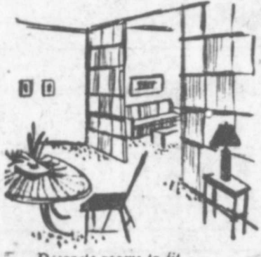
Decorate rooms to fit...

Two-toned chambrey styles this feminine warm weather dress by Terry Rodgers. Unique applique cut-outs and a modified "pussy-cat" bow in contrasting chambrey highlight the plunging neckline of this fashion-right casual. A skirt with fullness flaring out from the hips, gives that extra freedom which adapts itself for all-around wear.