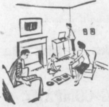
Your living plans.

Many families enjoy records, and if so, one of the best corners of the room should be devoted to this in-