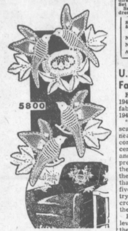
5800 Handsome Set

Directions for Crocheted Treasure Chair Set (Pattern No. 5800). Send 20 cents in coins, your name, address and pattern number. SEWING CIRCLE NEEDLEWORK 530 South Wells St. Chicago 7, Ill. Enclose 20 cents for pattern. Name: Address: