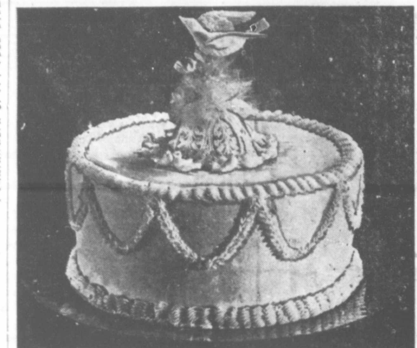
Bake a Cake Appropriate for the Bride! (See Recipes Below)