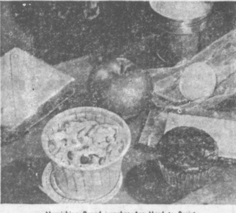
Nourishing Boxed Lunches Are Hard to Resist (See recipes below)