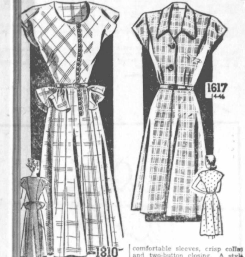
comfortable sleeves, crisp collar and two-button closing. A style of which you'll never tire.

Youthful Wear A YOUTHFUL frock for pleasant daytime wear with a peplum to whittle your waist, and a parade of buttons down the front. Simple and smart in a bright plaid or solid tone.