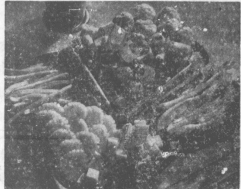
Crisp Vegetables Serve as Centerpiece (See recipes below)

Summer Vegetables ARE YOU MAKING the most of your garden? There are so many ways to serve vegetables, especially if you have your own garden-fresh variety on hand.