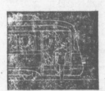
WROLLEY CARS? Horses pulled 'em once,