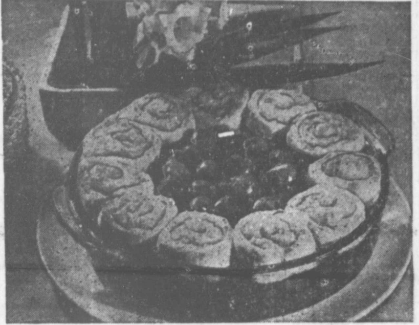
Fruit Puddings Are Mouth-Watering!