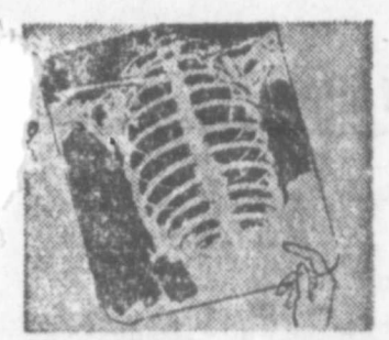
special kind of electricity—and that's