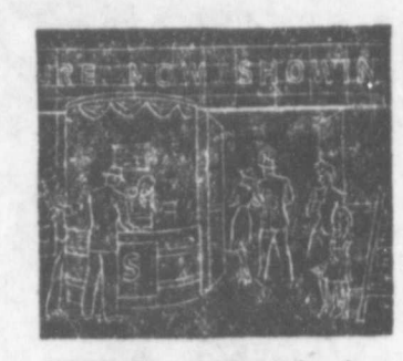
'em moving, makes 'em talk, and even