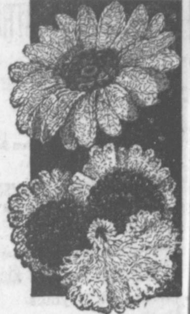
Pattern No. 7466

DID you ever see such gay potholders? They're practical, too. Good and thick, and sturdy. Made of rug cotton or candlewick.