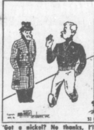
"Got a nickel? No thanks, I'll manage!"