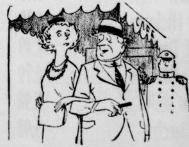
"Of course I gave him a tip. I told him to save his money at