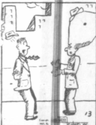
"Boyl! My head is THIS big this morning!"