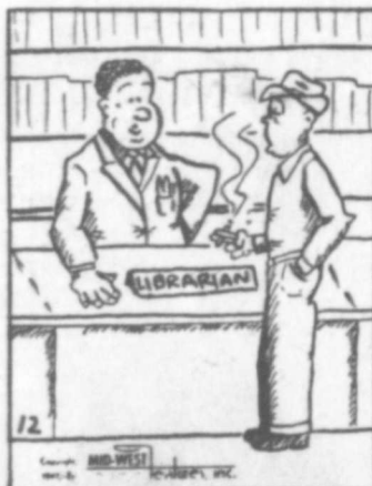
"Light or heavy? It doesn't matter—I have a car with me."