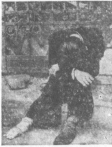
Ragged, disheartened and utterly discouraged, this German sits on the curbstone of a Frankfurt street amid the wartime rubble which has not yet been cleared away.