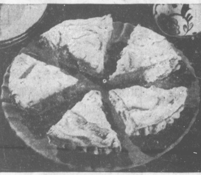
Try Lemon-Egg Pie for Potluck Supper (See recipe below.)