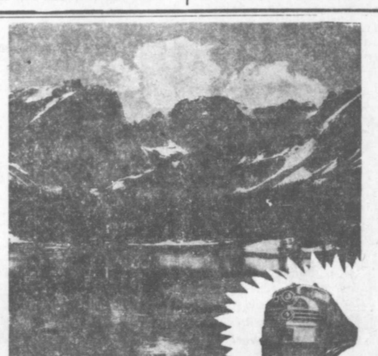
All vacation trails lead to and thru Colorado

It's Cool All Summer in COLORADO ... and when you step aboard the luxurious Air-Conditioned Texas Zephyr your glorious Vacation has begun! ★ MAIL COUPON BELOW FOR FREE LITERATURE ★ The coupon below will bring you free literature about a Zephyr vacation trip to Colorado or through this mountain wonderland to Yellowstone, Glacier, the Pacific Northwest or California. Burlington Zephyrs are not extra fare trains