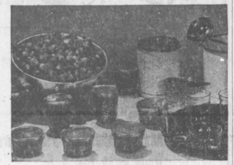
Make the Most of Your Strawberries!