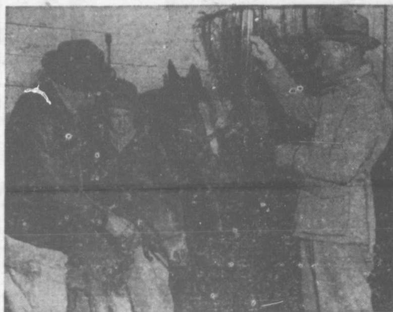
NEW BLOOD FOR AILING FOAL... Blood transfusions are no novelty now, even in the animal world. This tiny foal, suffering from a joint infection, is being given a blood transfusion.