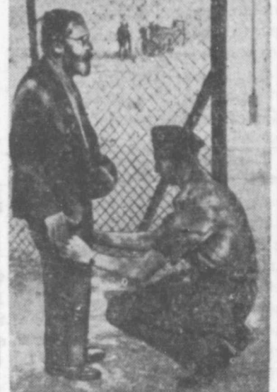
British soldier searches aged bomb suspect outside detention camp in Palestine.

By imposing martial law in Tel Aviv, the British sealed this Jewish industrial, financial and commercial hub from the rest of the country, seriously disrupting its business. Thus, the Jewish leaders were faced